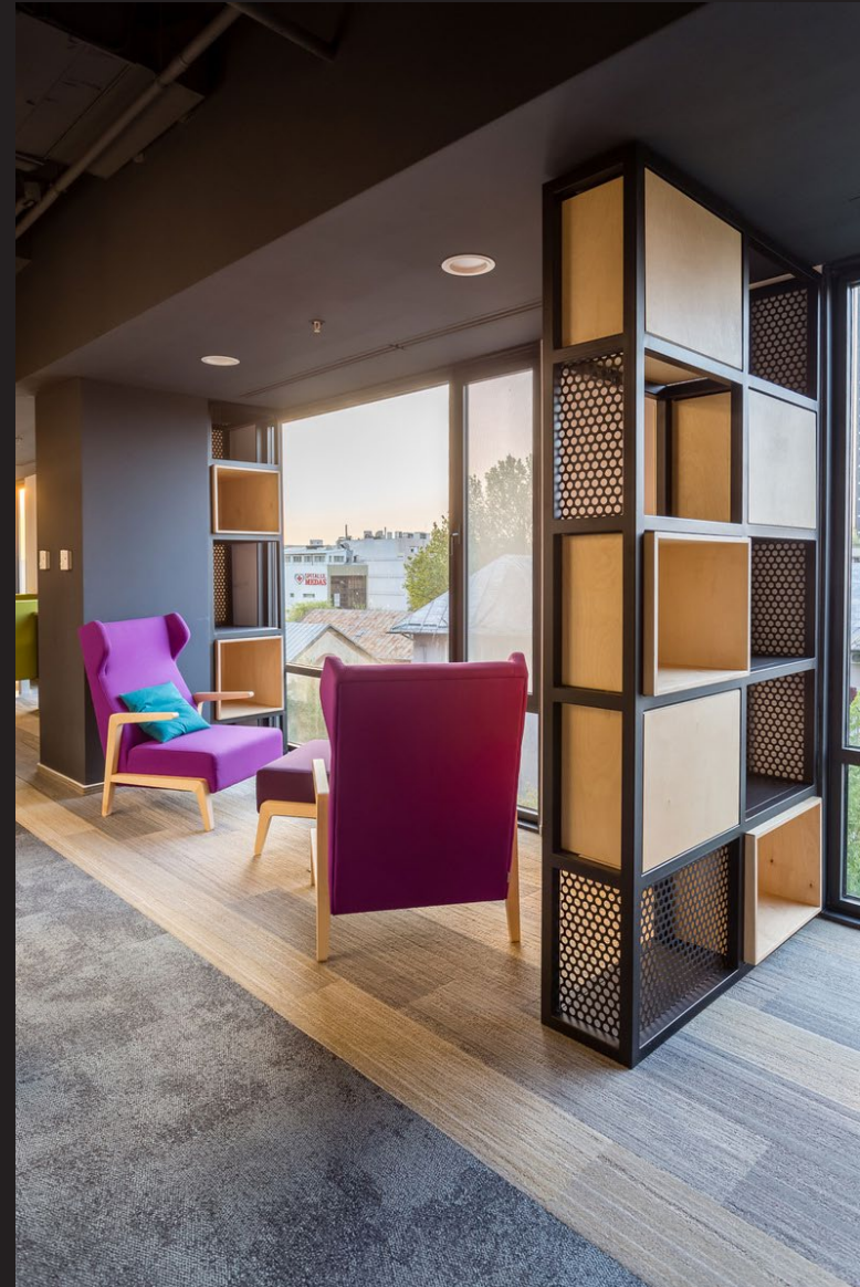
OLX GROUP OFFICES