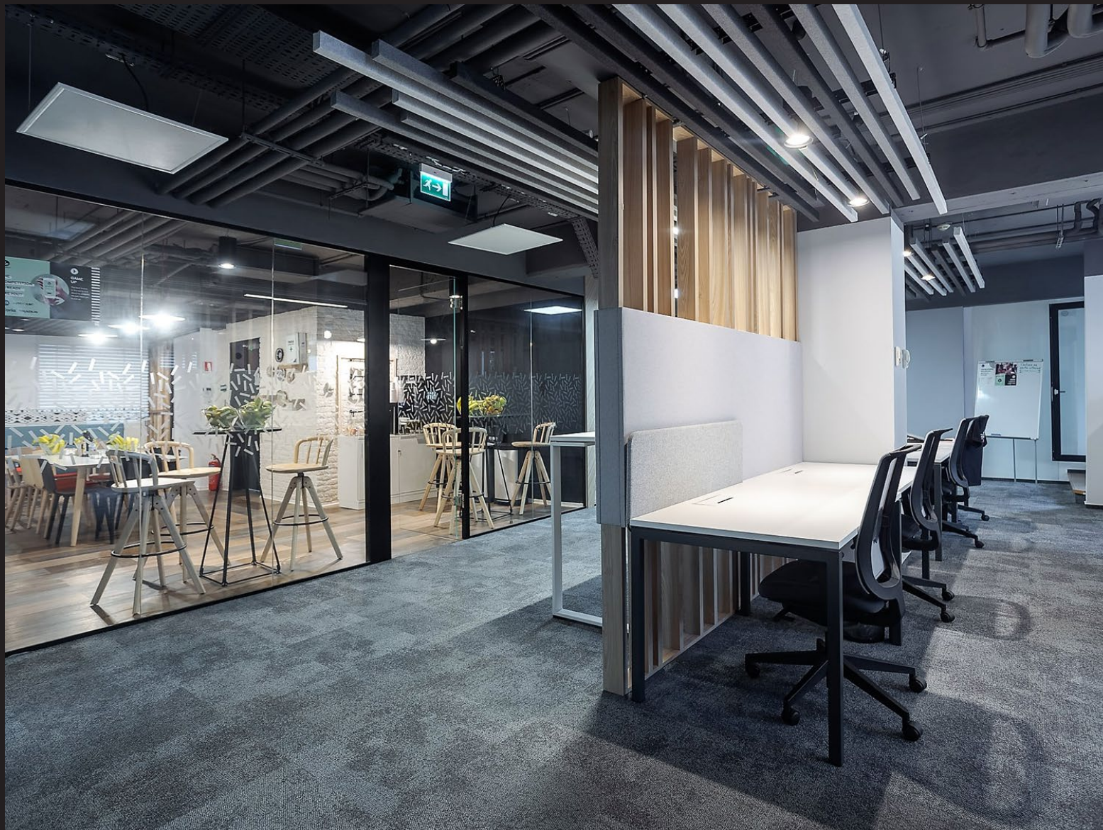
OLX GROUP OFFICES