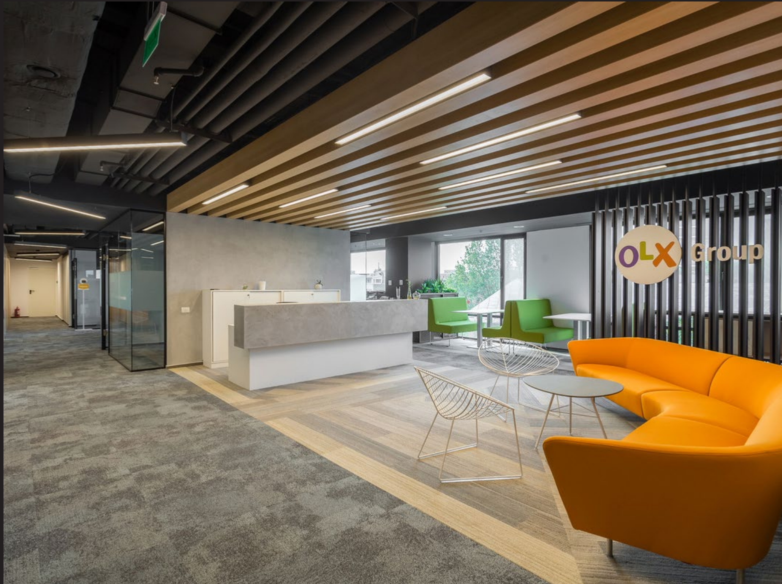
OLX GROUP OFFICES