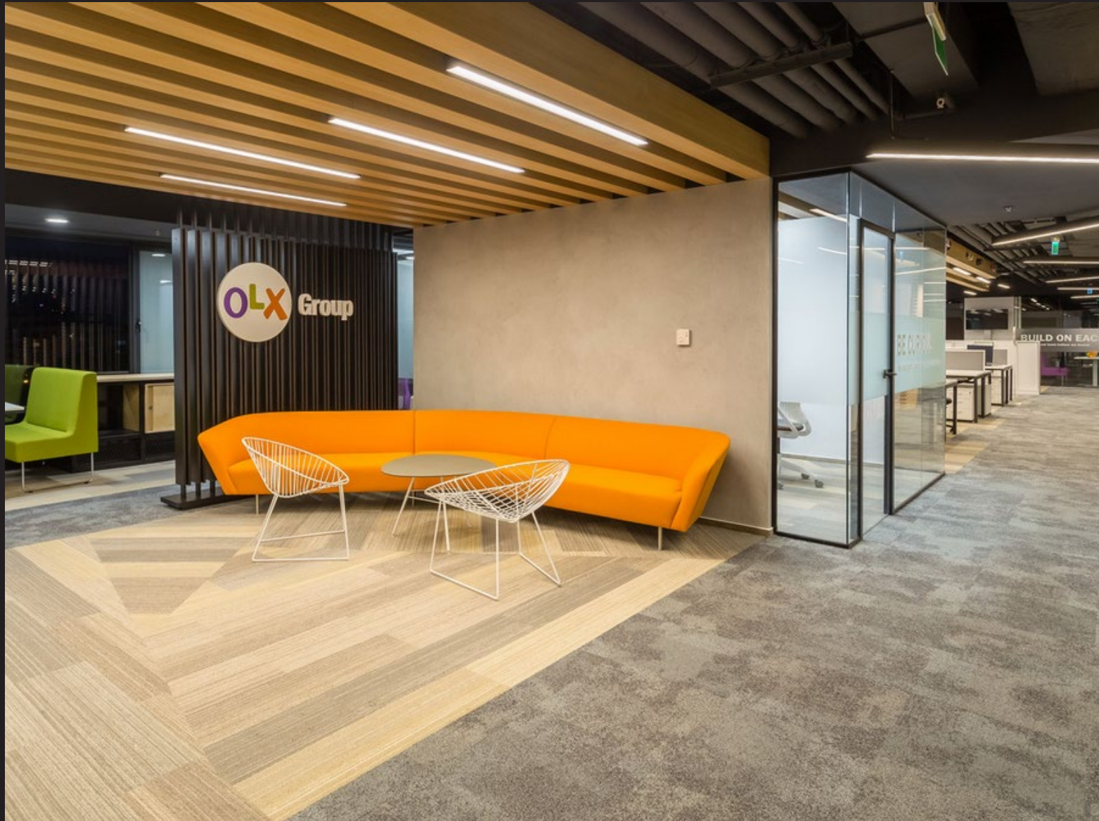
OLX GROUP OFFICES